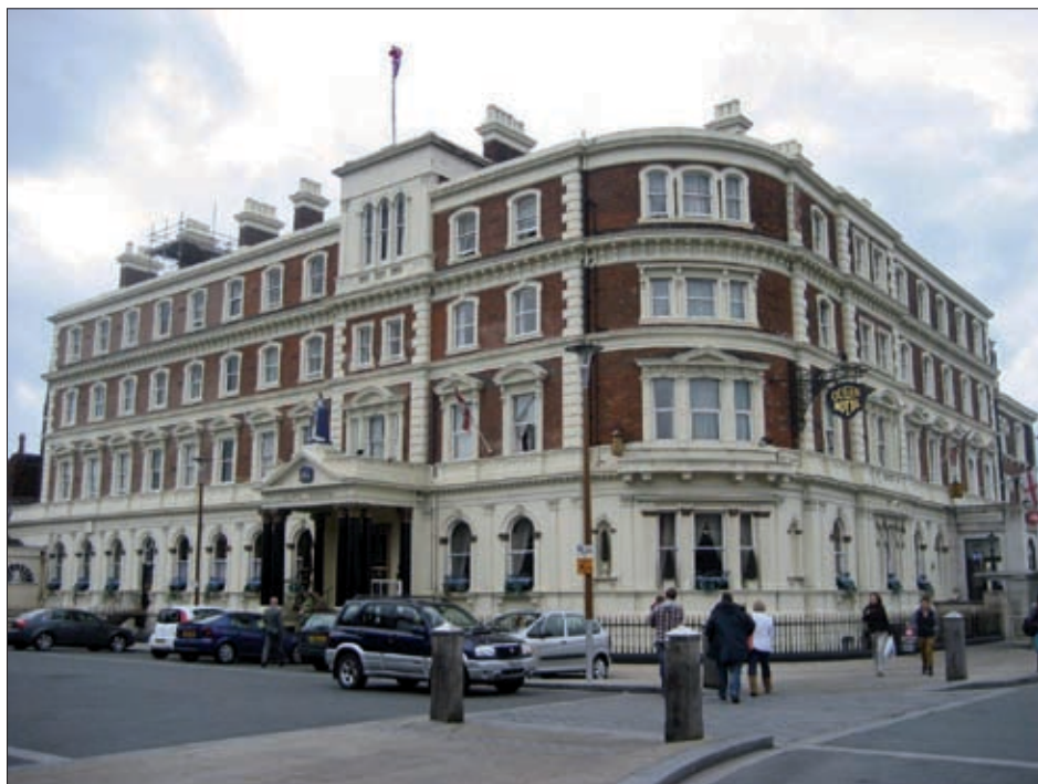
The Queen Hotel – headquarters for the Council weekend