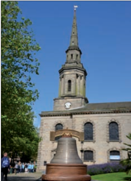
The Whitechapel Trophy outside St Paul's Church

The Ringing World is delighted to announce that some excellent ringing took place at St Paul's Church, Birmingham last Saturday and the winners of gold medals for the Method category, and also the second winners of the Whitechapel Trophy for the best overall performance, were Team 4: The G. & B. The winners of gold medals for the Call Changes category were Team 6: Sussex Young Ringers.