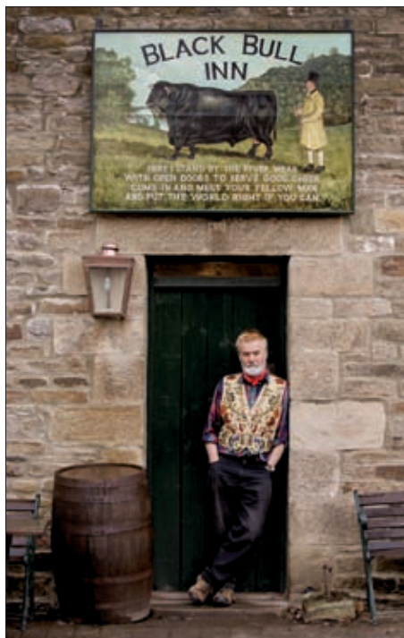
The Landlord at the Black Bull Frosterley