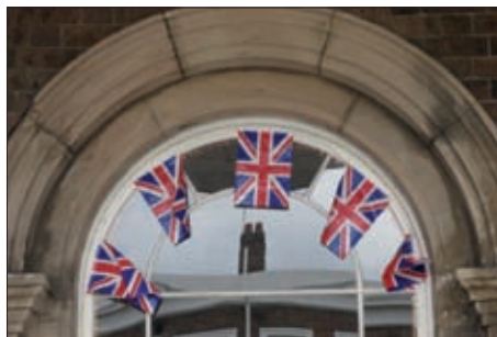
Chester railway station festooned with Jubilee flags

I think we must be honest and acknowledge that many Council members would rather have been elsewhere for this weekend ... and indeed quite a few of them were . Chester was a really attractive venue and the local Guild did a great job of organising an excellent programme of events.