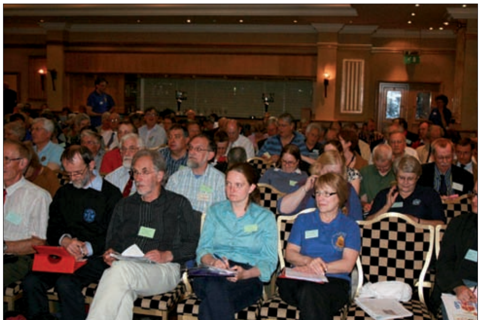
The 115th Central Council meeting in session at the Queen Hotel