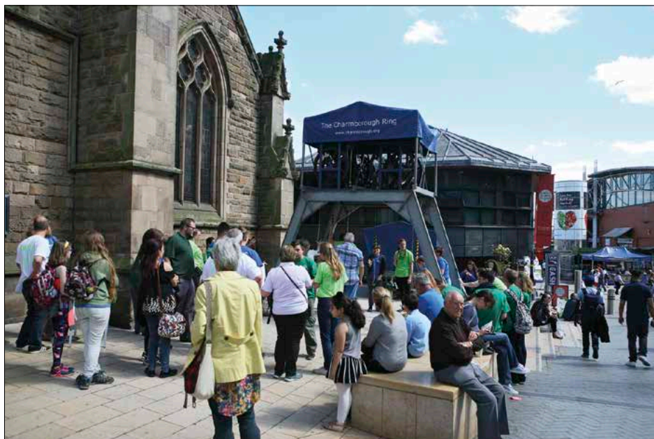
The Charmborough Ring outside St Martin's