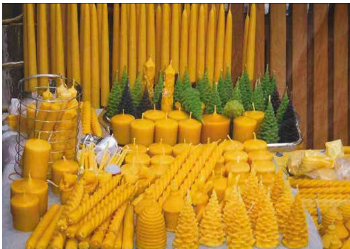
Candles ready for Christmas

For a few years we managed sixty colonies together, but we have cut down recently. We no longer have the energy to do the job well for so many colonies, but with fewer we are still able to enjoy this very worthwhile hobby. My beekeeping is certainly better than my bell ringing, but maybe I will improve.