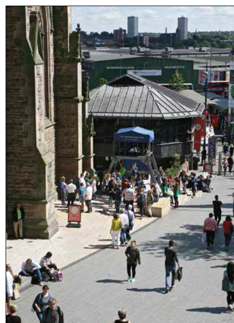
The Charmborough ring, set up at the front of St Martin's