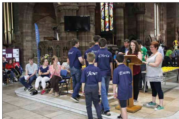
Young @ Herts go up to collect their medals