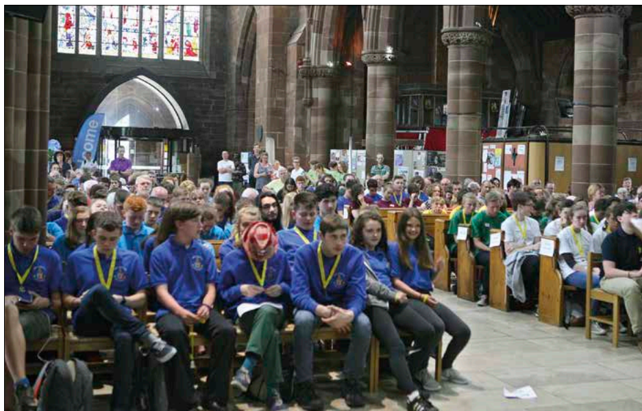
The results and presentation ceremony at St Martin's