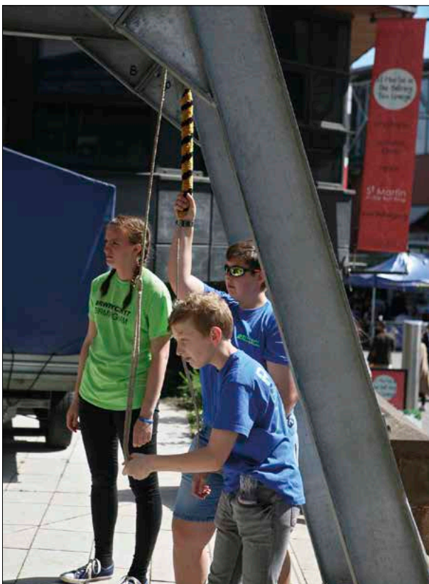
Mastering the light bells of the Charmborough Ring