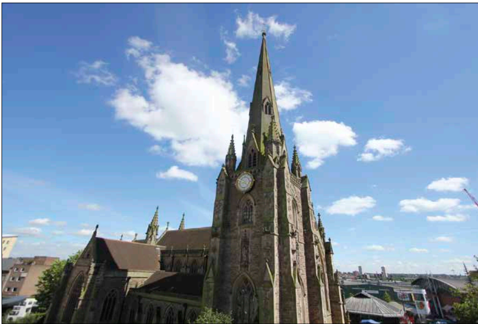
St Martin in the Bullring – our headquarters for the day

By midday the last teams had climbed the stairs for their qualifying piece before the judges considered their verdict. Unlike the National 12 Bell competition (the smaller rival to the RWNYC, with only 15 teams entering compared to 19 for ‘the big one’!), the results of the qualifiers cannot wait until The Ringing World comes out to see who had got through, as the final starts just 90 minutes after the last teams finish their qualifiers. Therefore, at 1pm, results were posted on the RWNYC website, Facebook page, and at St Paul’s, Jewellery Quarter (where the final was due to happen), St Martin in the Bullring and every open tower. Unfortunately, local radio was not broadcasting the results, but instead discussing very long tailbacks on the Aston Expressway which were somewhat holding up the Three Spires Team, heading to St Martin’s. Upon arrival, they were overjoyed to find out that they had indeed qualified, although less excited to hear that they were due to ring on the other side of the city centre (approximately a 15 minute brisk walk away) five minutes later! They needn’t have worried, though – the weather was fine and warm and everyone was quite happy to have an extra few minutes sunbathing!