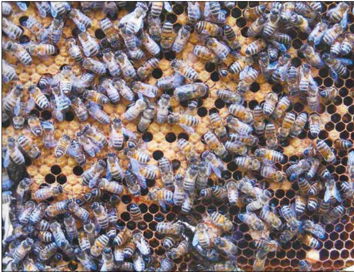
Bees on a comb