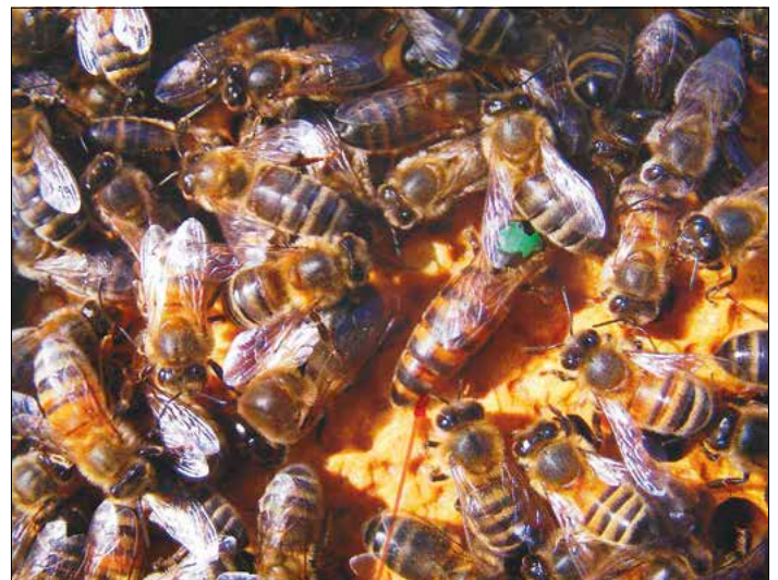
The queen bee